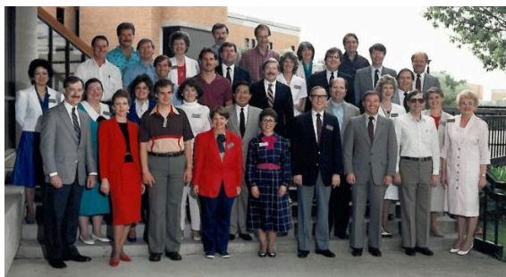
First class of Leadership Richardson

Our mission: we develop and provide leadership for our members and community through advocacy, alliances, economic development and education to advance economic prosperity.